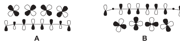
Scheme 2 A: Back-donating interactions between the tetraene LUMO and bonding dπ orbital; B: Back-donating interactions between pentaene LUMO and antibonding dσ orbital.

To gain an insight into the bonding of 4 , we carried out quantum calculations at the MP2 level on the model compound Pd 4 ( \mu_4\text{-}\eta^2\text{:}\eta^2\text{:}\eta^2\text{-C}_8\text{H}_{10} )( \mu_4\text{-}\eta^3\text{:}\eta^2\text{:}\eta^2\text{-C}_{10}\text{H}_{12} ). 16 The optimized geometry agrees well with the structure of 4 , where calculated Pd–Pd distances are 2.65 Å for outer bonds and 2.59 Å for inner. Natural charge analysis shows that the Pd 4 moiety possesses a considerable positive charge (+1.68), and the negative charge is shared by the C 8 H 10 ligand (−0.83) and C 10 H 12 ligand (−0.85). The polyene ligands in the corresponding dicationic model [Pd 4 ( \mu_4\text{-}\eta^3\text{:}\eta^2\text{:}\eta^2\text{-C}_{10}\text{H}_{12} ) 2 ] 2+ are charged positively (+0.21 for each), while the dominant positive charge is